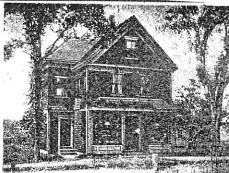
Peterson's Drug Store where the ice cream cones come from.